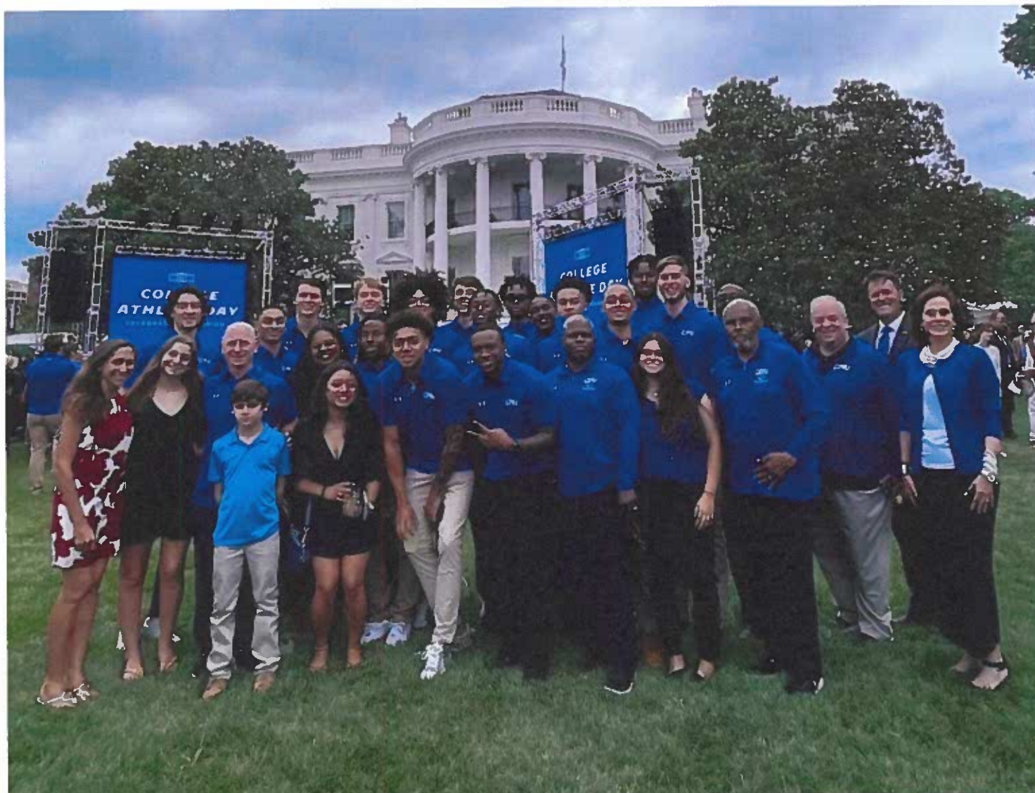
National Champion Men's Basketball Team Celebrated at the White House Men's Basketball